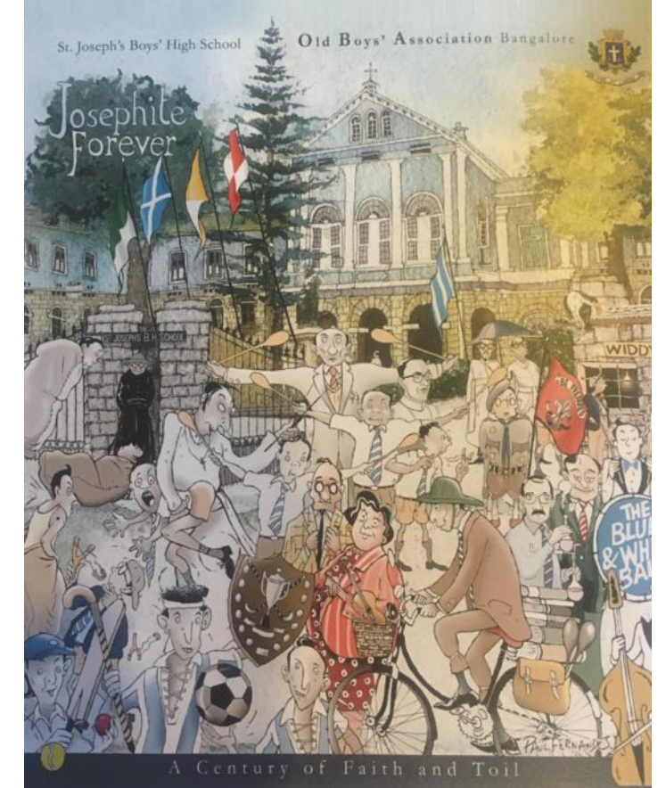
Inside the book

We are basically torchbearers. We run a leg of a long race. It is a marathon. Hundred years are over. We look forward to the next hundred years. We hope that all the values and camaraderie only get stronger over time. We hope that we can get younger talent to join us – stronger legs to run the race.